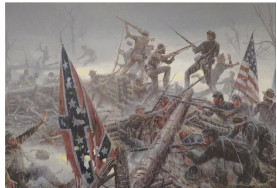
THE BLOODY ANGLE